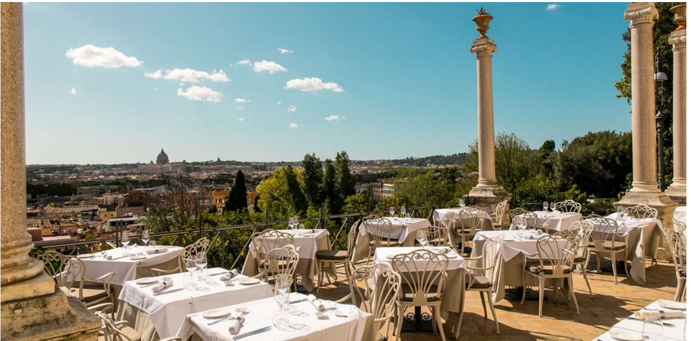
Casina Valadier Terrazza

Starting from the Pincio, from which you can enjoy a spectacular view of the city, you arrive at the gates of Villa Borghese , a green heart in the heart of Rome and from which you can access both the sumptuous and baroque Galleria Borghese , one of the most amazing museums of the eternal city, and to the National Gallery of Modern and Contemporary Art , which houses the most complete collection dedicated to Italian and foreign art between the 19th and 22nd centuries.