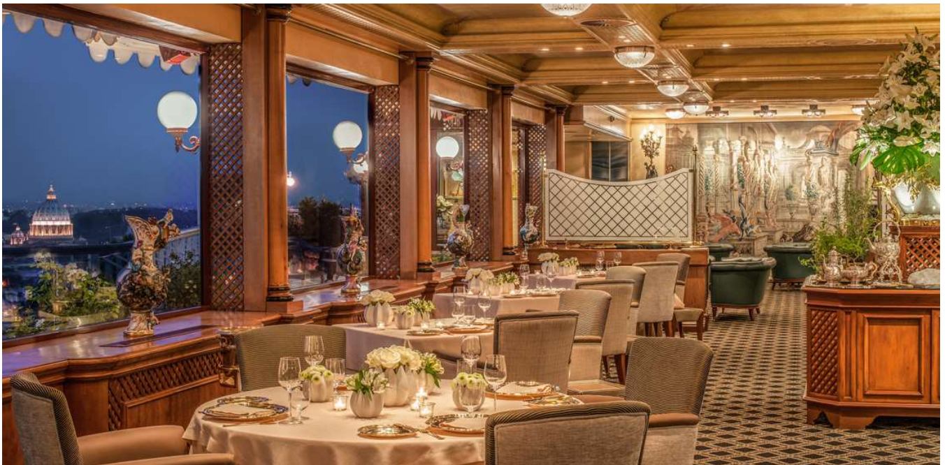
La Pergola, Rome Cavalieri