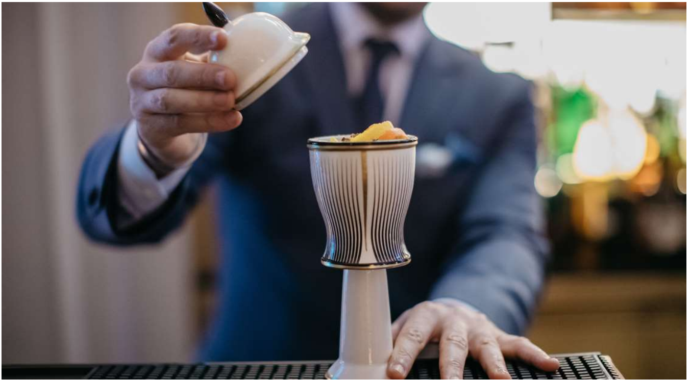
Cocktail at the LUMEN Bar, St. Regis Rome

The Stravinskij Bar of the Hotel de Russie is one of the most evocative meeting places in Rome for its unmistakable style and its wonderful private garden located at the foot of the Pincio. The Bar has an atmosphere of sober elegance with purple velvet armchairs inside and wrought iron tables and chairs with elegant green seats in the adjacent external Piazzetta Valadier.