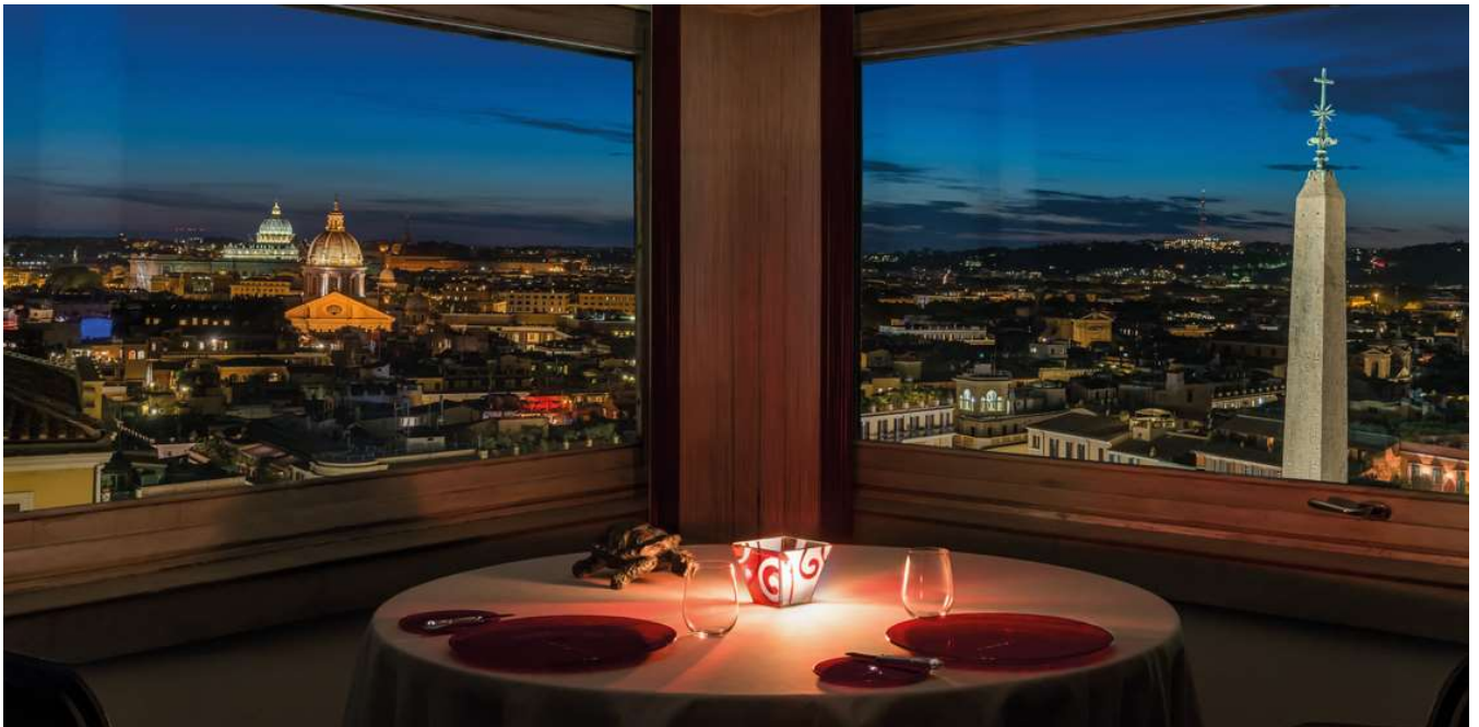
Ristorante Imago, Hassler Roma

and prides itself on being a place where vision and taste intertwine to offer a unique culinary experience.