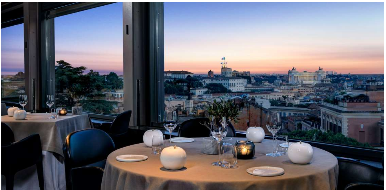
La Terrazza, Hotel Eden Roma