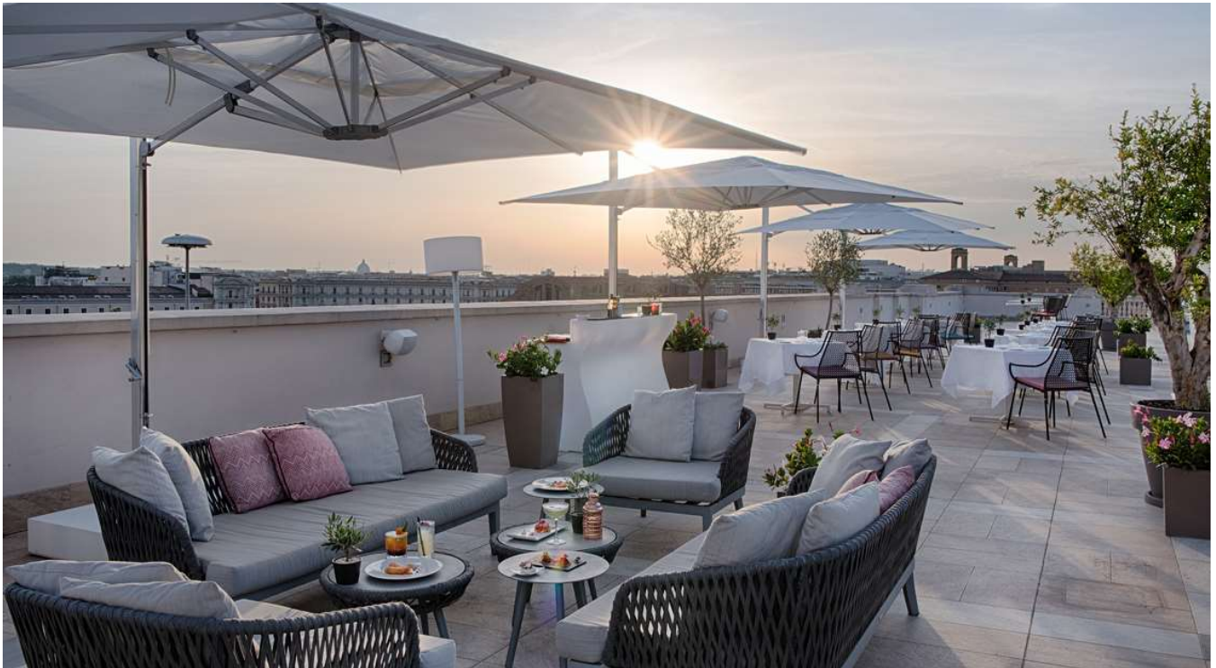
Rooftop bar, NH Collection Roma Palazzo Cinquecento

view of the garden which offers an exclusive relic of Rome's ancient history: a stretch of the Servian Walls dating back to sixth century BC. Guests can also breathe in the history of Rome on the splendid panoramic terrace on the fifth floor. Here, after a day of work or shopping, guests can have an excellent aperitif or organise a private event accompanied by the magical views of the city.