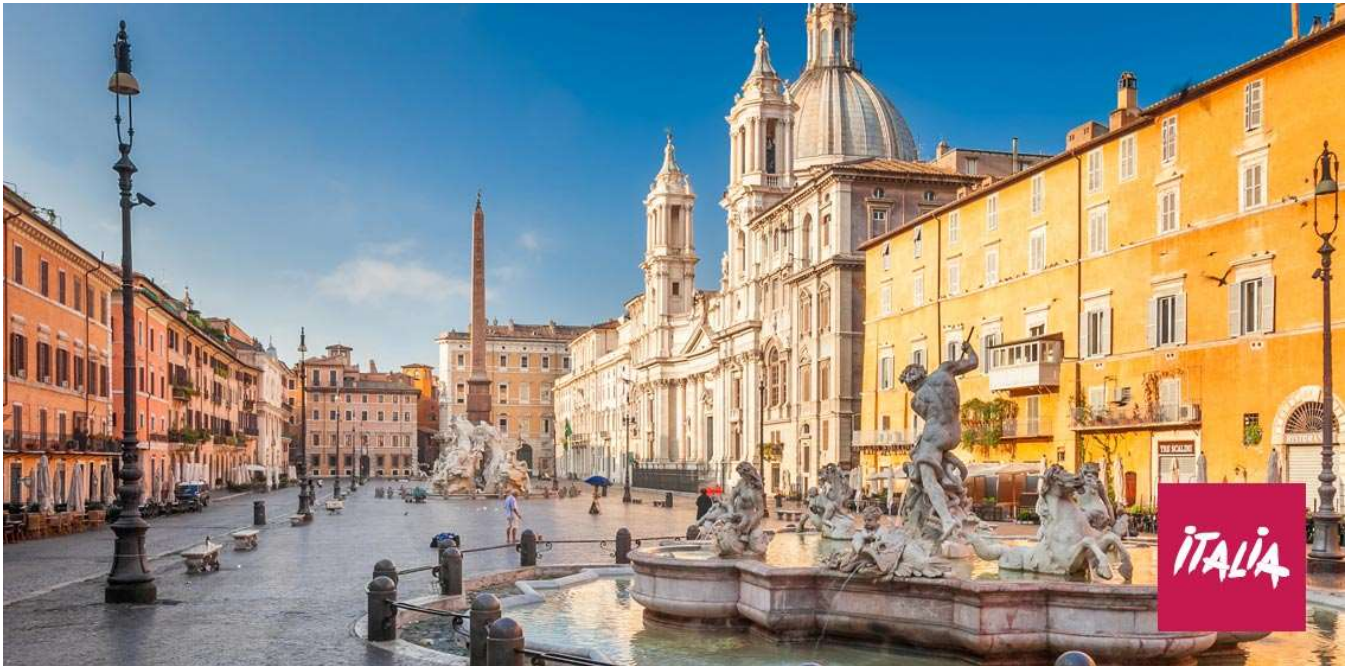
Piazza Navona, Rome