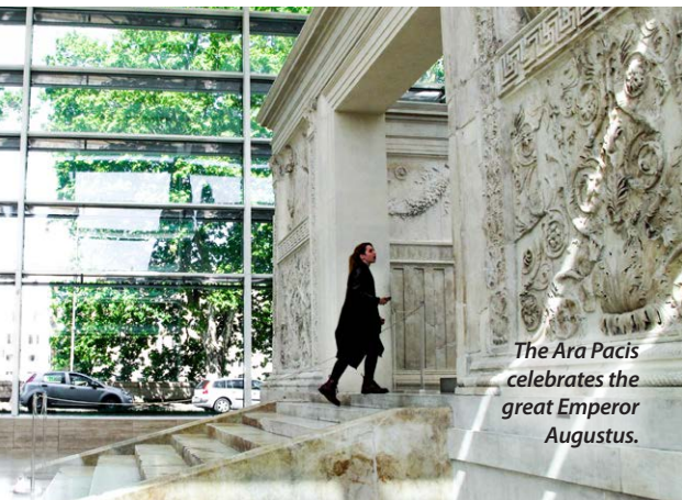
The Ara Pacis celebrates the great Emperor Augustus.