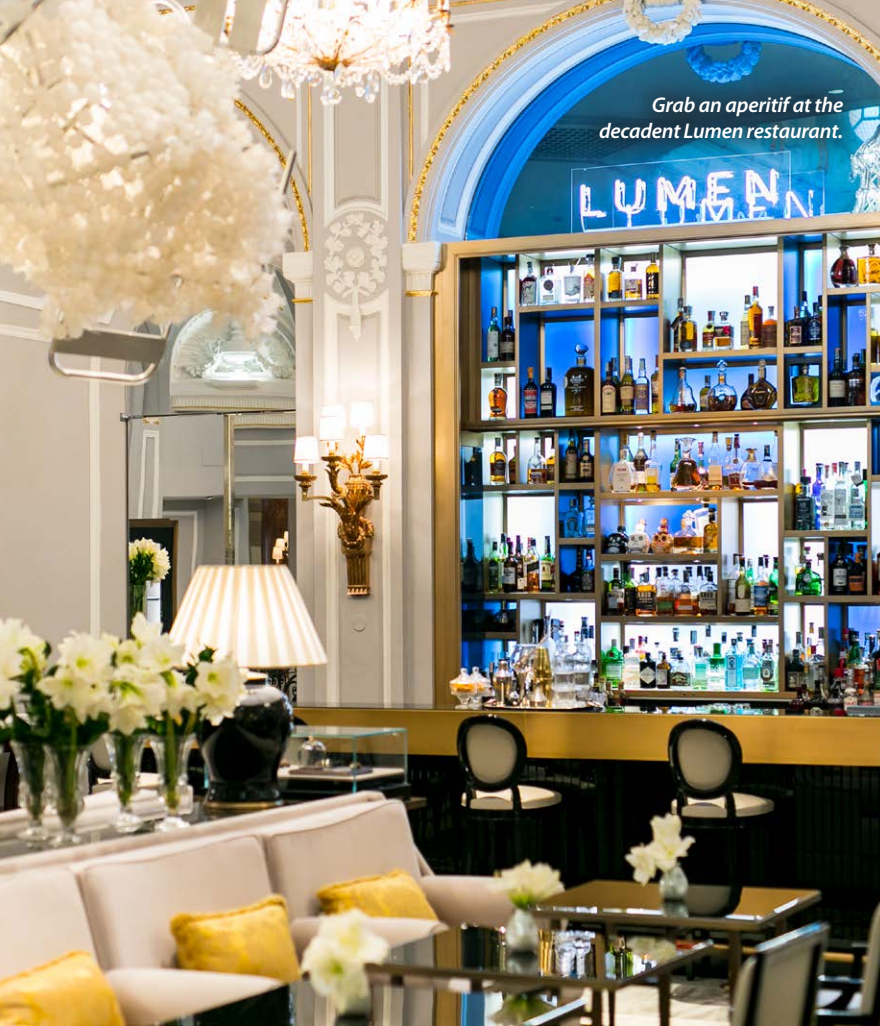
Grab an aperitif at the decadent Lumen restaurant.