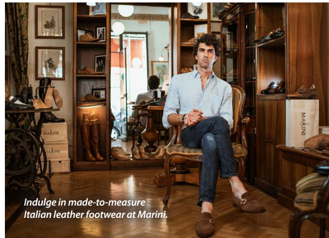
Indulge in made-to-measure Italian leather footwear at Marini.