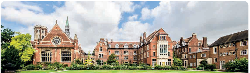
Homerton College Cambridge

A full-immersion experience learning by doing together.