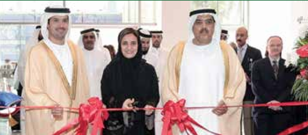
SHOW OPENED BY HER EXCELLENCY SHEIKHA LUBNA BINT KHALID AL QASIMI MINISTER OF INTERNATIONAL COOPERATION AND DEVELOPMENT